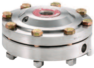
Type 741 – Threaded (w/flushing conn.) ¼, ½, ¾, 1 NPT