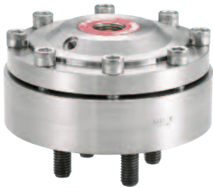
Type 702 – Low Pressure Flanged ½, ¾, 1, 1½, 2, 3 NPT